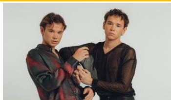
Sweden Marcus & Martinus - Unforgettable